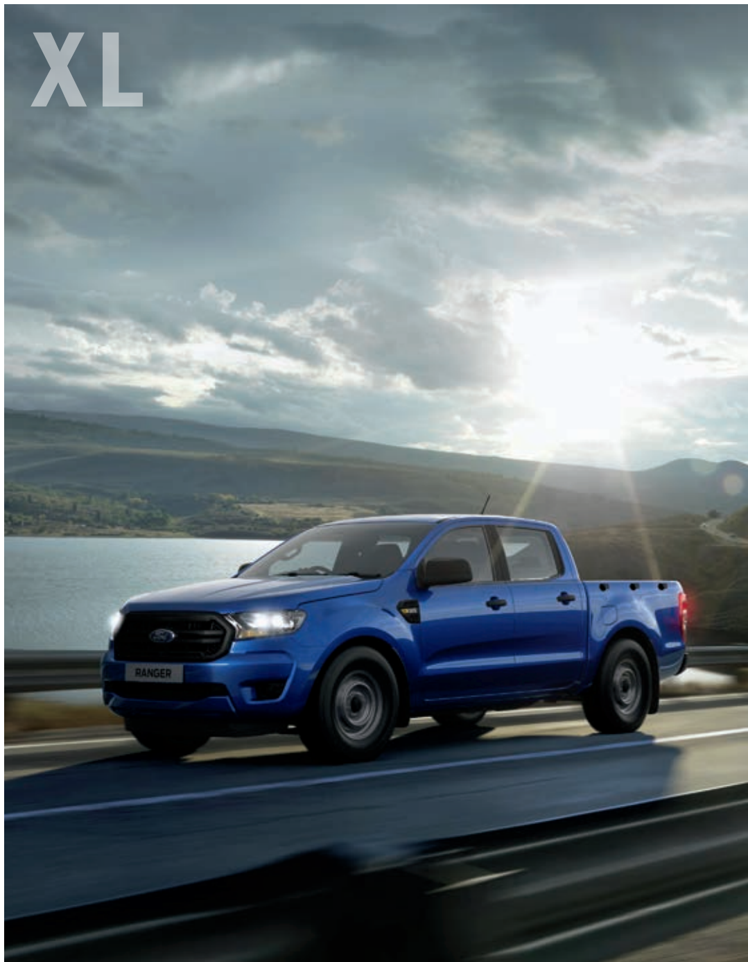
Double Cab 4x4. Lightning Blue. Ebony Circuit Cloth. Available equipment.