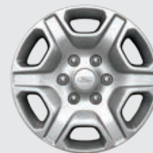
17" 6-Spoke Aluminum Standard

Security Lock Group 2: includes flip key