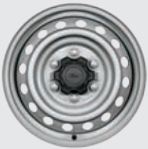
16" x 7" Steel Standard

4x4 drivetrain with electronic shift-on-the-fly (RHD)