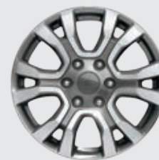
18" 6x2-Spoke Aluminum Standard

ICE Pack 104: includes AM/FM stereo with SYNC 3, Navigation, 8" touchscreen, high-series cluster, 2 USB ports and 6 speakers (RHD)