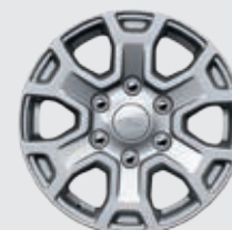
16" 6-Spoke Aluminum Standard

6-speed automatic transmission AVAILABLE