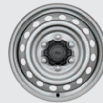
16" x 7" Steel Standard

Engineered Trim Pack 25: includes open-style rear axle (4x2); limited-slip rear axle (4x4); black front fender gills; Security Lock Group 1 with 2 manual keys; manual tailgate lock; Safety Pack 3 with driver's front airbag, 1 light frame and 4-wheel Anti-Lock Brake System (ABS); black grille, door handles, liftgate handle and sideview mirror caps; vinyl flooring; Front Seat Pack 4 with 2-way manual driver's seat and Belt-Minder®; Rear Seat Pack 5 with 2nd-row bench seat (Double Cab); variable-speed intermittent windshield wipers; and manual air conditioning