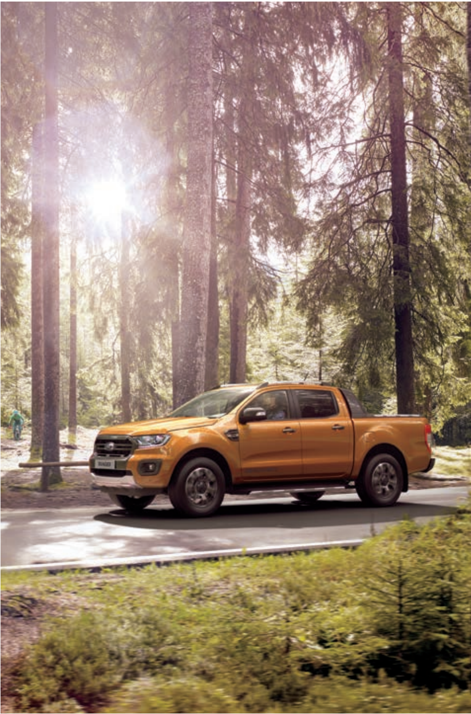
WILDTRAK Double Cab 4x4. Saber. Available equipment.